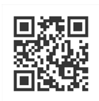
Figure 1: QR Codes are 2-D Matrix Barcodes

QR codes are said to be the next generation of barcodes. Barcodes were first introduced in 1970s. These are set of parallel lines and numbers which can store up to 20 characters and are very commonly seen on all the retail products. Information such as commodity prices, date of manufacturing etc. can be easily encoded in such barcodes. Introduction of barcodes revolutionized the retail industry as information could be scanned in seconds using specially designed laser units and there was no need to feed the quantity and pricing information manually. The QR codes were introduced to store much more information. They can