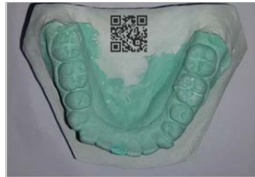
Figure 2: Patient Study Model with QR Code

QR codes also have a role to play in identification of patient appliances and providing instructions to the patient regarding their appliances. The QR code can be printed on a paper, after being laminated it can be incorporated into the orthodontic appliance. The Orthodontists can scan the QR code to identify which patient’s appliance it is. Also instructions regarding the appliance can also be encoded into QR code, which can be scanned by the patient at their convenience. This helps to decrease the necessity of verbally reinforcing the instructions to the patient. QR codes also form an excellent tool for patient education. Patients can be shown hundreds of educational videos or images just by scanning the code. The code can be shared with the patients and their parent, thus by helping the increasing awareness among them. Being technology friendly this helps to evoke an enthusiasm in today’s smartphone generation.