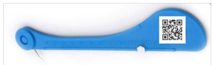
Figure 3: QR Code on a Hyrax Key Can Guide the Patient about Activation Schedule and Also Link to a Video Showing How to Activate the Hyrax can be Encoded

QR codes can be used for dental education and student work assessment. Interactive fixed and removable